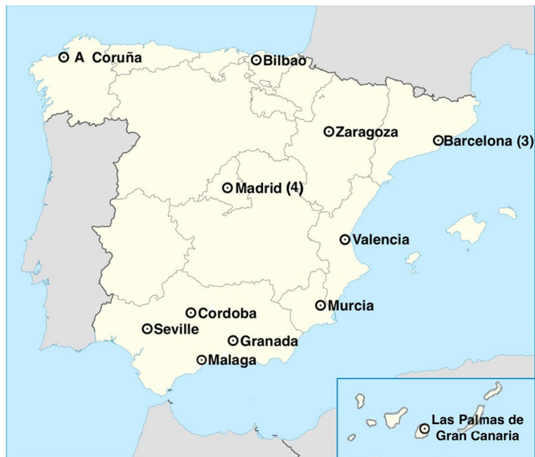
Figure 1 Map showing the geographical distribution of the 17 centers that participated in the survey.

submitted in November 2023, and we accepted responses through January 2024 (Supplemental material).