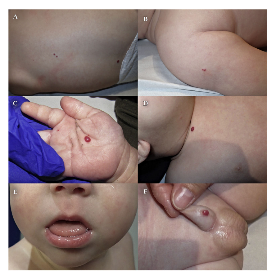
Figure 1 A-D and F) Clinical image. Red papules with a vascular appearance measuring 2–6 mm located in the back, right shoulder, right palm, right clavicle and penis. E) Clinical image. Mild macroglossia.

an increased risk of embryonal tumours.<sup>2-6</sup> However, vascular tumours are rare in affected patients.