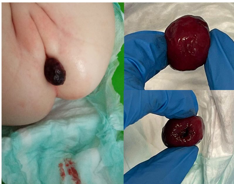
Figure 1 Left: clinical photograph of the patient. Purplish mucosal lesion prolapsing through the anus. Note the presence of fresh blood on the diaper. Right: mucosal mass with an ulcerated base that the patient expelled spontaneously through the anus.