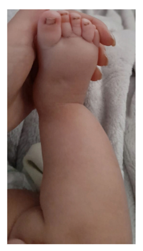
Figure 3 Progressive reduction of lymphoedema after 6 months of compression and physical therapy.

extremities, in isolation or as part of a syndrome.<sup>2</sup> Although it is infrequent and it is still unclear what it is associated with, the presence of congenital lymphoedema must prompt an investigation of the family history and a lymphatic and genetic evaluation.<sup>3</sup> Appropriate multidisciplinary treatment may prevent progression to functional limitations, complications and sequelae. In selected cases refractory to conservative treatment, surgical treatment with vascularized lymph node transfer is a possible alternative that has achieved good results in recent case series.<sup>4</sup>