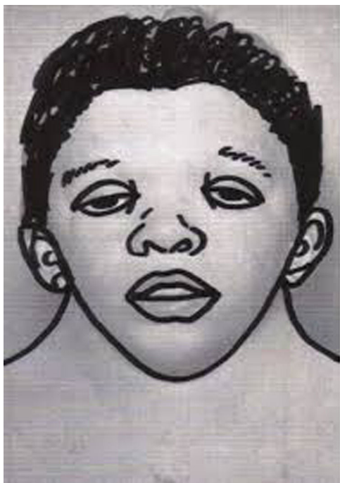
Figure 1 Drawing illustrating the typical facial features of Noonan syndrome.

The literature also describes electrocardiographic abnormalities in these patients (50%). 6 Frequently, these involve wide QRS intervals with a predominantly negative pattern in the left precordial leads and left axis deviation with giant Q waves, even in the absence of structural cardiac abnormalities. Arrhythmias are infrequent. 7