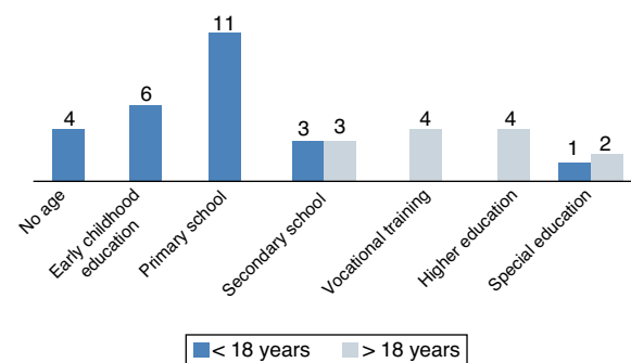
Figure 2 Number of patients that reach each level of educational attainment. We divided patients in two age groups: <18 years (25 patients) and ≥18 years (13 patients). Ten children required academic support.

(a) School attendance : of the 34 school-aged patients, three (8.8%) attended special education programmes and 31 (91%) attended regular school, although ten of the latter (29.4%) required continuous special needs support. Fig. 2 shows the educational attainment of patients according to their ages. Four patients older than 18 years (30%) reached a higher education (university, 3; post-secondary vocational school, 1), (b) employment : four patients older than 18 years (30%) had begun remunerated employment.