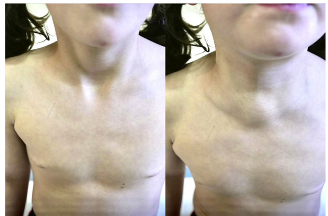
Figure 1 Frontal view. Left: no evidence of a suprasternal mass with the patient at rest. Right: appearance of a suprasternal mass with performance of the Valsalva manoeuvre, which did not cause pain, aphonia, dysphagia or dyspnoea.

Sonography is the gold standard for imaging and usually sufficient. 2,3 In this case, the ultrasound examination detected superior herniation of the thymus (Fig. 3). This quick and safe diagnosis made other procedures involving radiation, biopsy or surgery unnecessary. 2,3