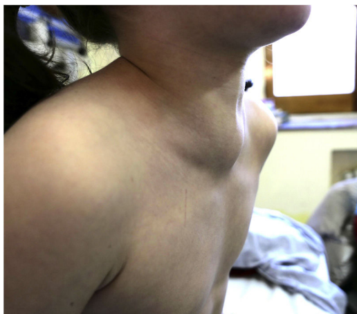
Figure 2 Lateral view of the suprasternal mass during the Valsalva manoeuvre. The mass was not compressible, there was no crepitus and was silent on auscultation.