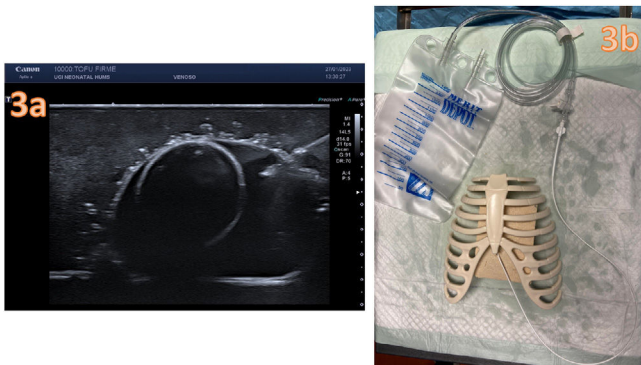
Figure 3 Construction of the ultrasound-guided pericardiocentesis model using tofu. (a) Ultrasound-guided pericardiocentesis. (b) Completely set-up pericardiocentesis kit.

We describe a model that is easy to reproduce, simple, quick, low-fidelity and inexpensive (approximately 10 euro) to provide training on this inherently complicated technique (Figs. 1–3).