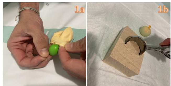
Figure 1 Construction of the ultrasound-guided pericardiocentesis model using tofu. (a) Fill a small balloon (5 cm diameter) with saline solution and insert it in a larger one (8 cm diameter), fill this second balloon with saline using a 50 mL syringe. (b) Open a package of firm tofu and make a hole with an ice-cream scoop.

Pericardiocentesis is an infrequent and high-risk procedure, and simulation can provide a comfortable, low-stress