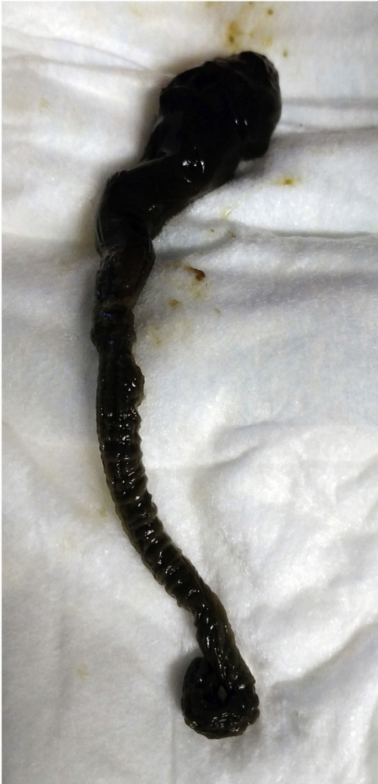
Figure 2 Meconium-stained umbilical cord imprinted with the haustra of the colon.

Early diagnosis is important to enable prompt treatment and avoid performance of unnecessary examinations and tests. The associated occurrence in 2 monozygotic twins could suggest a yet unknown genetic component.