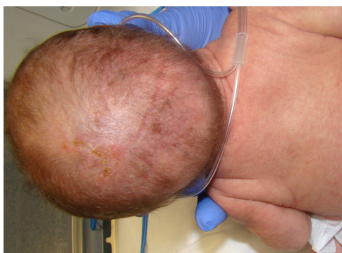
Figure 3 Cutaneous involvement in scalp with alopecic plaque (case 5).

In agreement with previous studies, blistering (vesicular stage) was the first cutaneous manifestation to develop in all cases at onset in the neonatal period, in some cases overlapping with other stages. 2,12