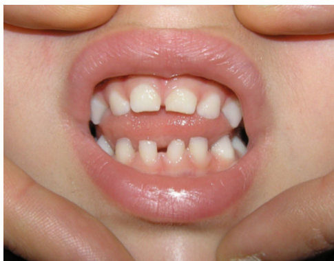
Figure 2 Conical teeth (case 11).