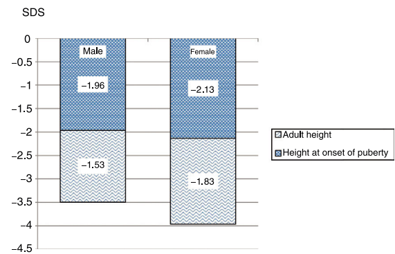
Figure 2 Height at onset of puberty and adult height by sex in children with isolated growth hormone deficiency.

The mean height gain standard deviation score (SDS) in the first year of treatment was 0.49 SD score. The PAH adjusted for BA/CA increased by 0.6 SD. Fig. 1 shows the progressive improvement in height gain. The height SDS improved by 0.79 from baseline to puberty in both sexes, and from puberty to reaching the adult height by 0.43 in male patients and 0.29 in female patients. The total increase in height SDS until achievement of the final height was greater in male compared to female patients: 1.22 SD versus 1.08 SD ( Fig. 2 ). The increase in the actual adult weight relative