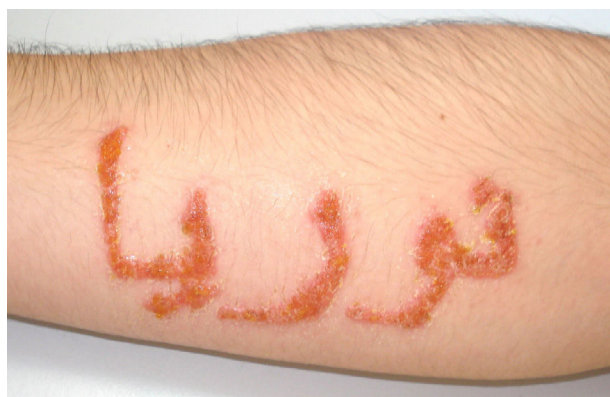
Figure 1 Allergic contact dermatitis caused by PPD from a black henna tattoo in an adolescent aged 16 years. The patient developed a vesicular rash with scab formation delineating the application of henna for the tattoo.

The aim of this study was to determine the prevalence of sensitisation to PPD in the population of paediatric patients referred to a skin allergy clinic, its epidemiological characteristics, and its association with black henna tattoos.