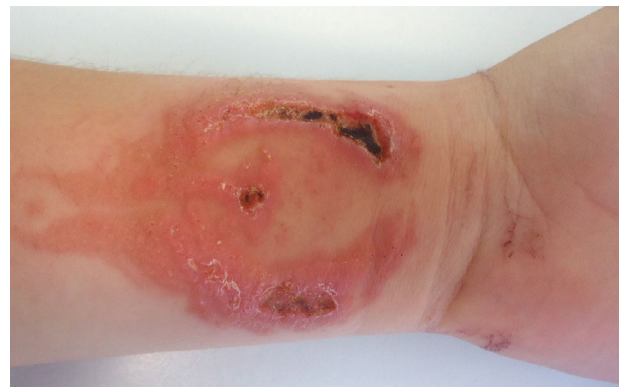
Figure 4 Allergic contact dermatitis due to PPD with necrotic lesions from a phoenix tattoo with black henna adulterated with PPD. The lesions will result in permanent scarring.

Atopic contact dermatitis secondary to exposure to PPD usually has a favourable prognosis. However, the allergic reactions it produces can sometimes be very serious, threatening the life of the patient. 11–13 The literature also includes descriptions of allergic reactions to PPD resulting in necrotic lesions and unsightly scars (Fig. 4), post-inflammatory hypopigmentation and keloid formation. 11 In patients sensitised to PPD from a tattoo, the use of hair colouring products can produce very serious allergic reactions for a lifetime due