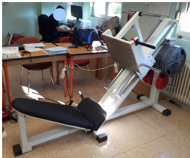
Figure 1 Incline leg press used for strength assessment.

Body composition was assessed with a DXA scan using the General Electric Lunar Prodigy Pro ® analyser and the EnCORE 2009 ® operator platform. Lean mass, fat mass and bone mass were assessed by whole-body scans with the patient placed supine in the anatomical position. The software of