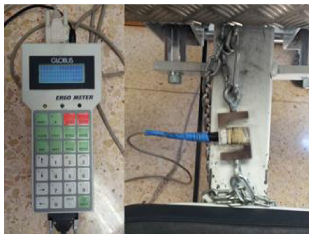
Figure 2 Processor and strain gauge.

the device allowed us to select the lean mass of the lower limbs.