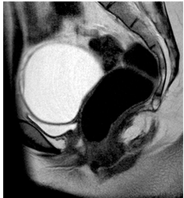
Figure 1 Pelvic MRI. Sagittal T2-weighted image showing an ovarian cyst against the superior portion of the bladder, and the posterior wall of the bladder adjoining the anterior wall of the rectum due to the absence of the uterus and the upper third of the vagina.

the chronological age. The levels of estradiol (92 ng/mL) and gonadotropins (luteinising hormone, 13.1 mIU/mL and follicle-stimulating hormone, 4.6 mIU/mL) were in the normal range. The patient underwent magnetic resonance imaging of the abdomen and pelvis (Fig. 1), which found that the uterus and the upper third of the vagina were absent. The ovaries were in the normal location, with detection of a cyst in the right one. The morphology and position of the kidneys were normal.